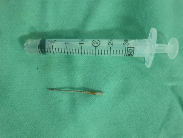
Figure 3: Sewing needle retrieved from the urethra endoscopically.

of the foreign body as well. The foreign body insertion may be motivated by sexual gratification and autoeroticism (6). The foreign body is removed in these patients, but there are chances that the patient may insert the foreign body again. So, the counselling and psychological treatment of the patient are vital prevention strategies in such cases (7).